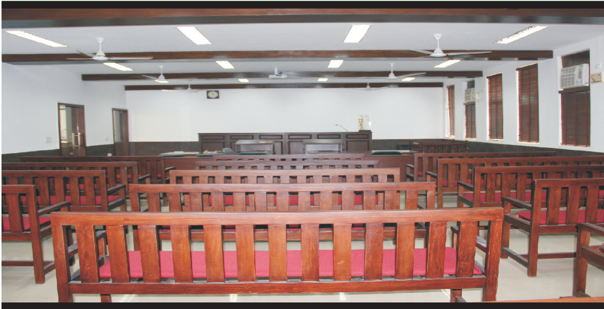
Moot Court Hall