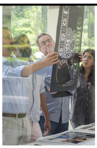
Sufi Rock - entered into Design Craft -Graphic Design in 2013