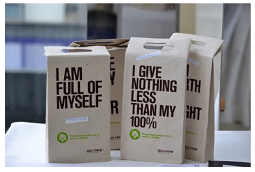
Good Paper Project - entered into Design for Packaging in 2013