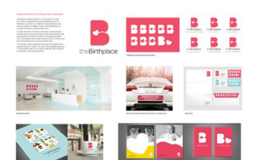
Branding a Birthing Center - entered into Design for Identity in 2013